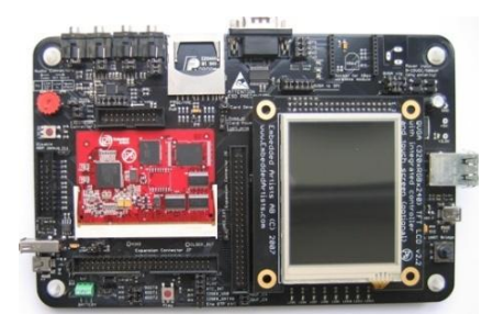
Developer's Kit: Base Board and OEM Board